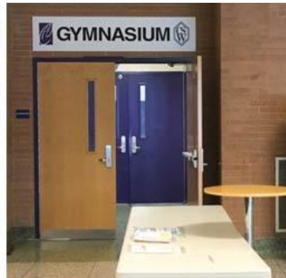
Gym Doors Screening Area