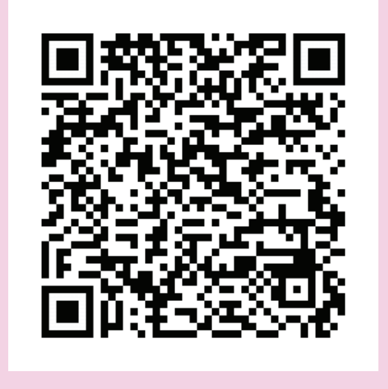
Block Rotation Calendar