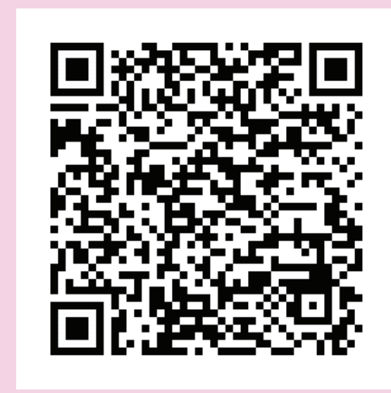
CCSA Building Calendar